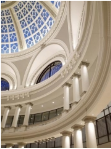
SF Westfield Emporium Architects: KA Incorporated & RTKL

To achieve this goal, the solutions use a combination of commercially available but underutilized technologies, lighting controls, expert lighting design, and integrated systems. The DOE developed an interactive web tool that allows you to enter specifics about a project and then produce a detailed report on possible lighting strategies.