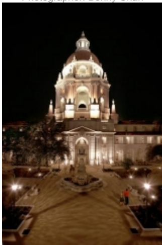
Pasadena City Hall Architect: Architectural Resources Group